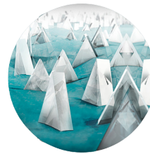
Maximum stock removal & faster cut thanks to Actirox's geometrically shaped grain