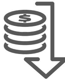
VSM Ceramics Plus